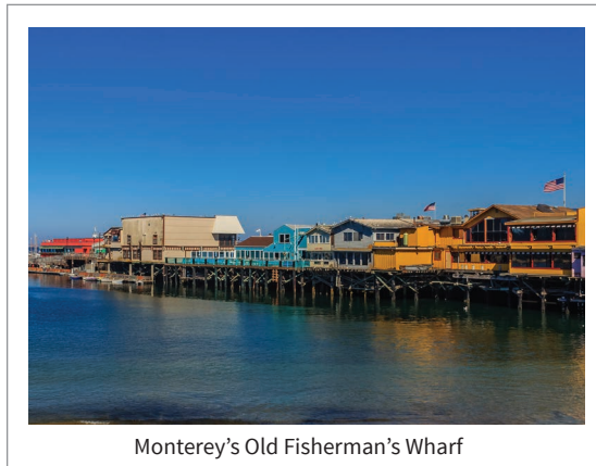
Monterey's Old Fisherman's Wharf

Monterey Bay Aquarium sits right on the rocky shore of Monterey. Many sea creatures—sometimes even whales—can be spotted from the aquarium's outdoor deck. This aquarium is one of the best in the world. It's a great place to observe and learn about all the sea life around Monterey. For an even closer look, whale-watching boats take people out into the bay. They leave from Monterey's Old Fisherman's Wharf. There, fishing boats also deliver their catch right to the restaurants along the wharf. People feast on fresh clam chowder and fish dinners. In Monterey, it's all about the sea.