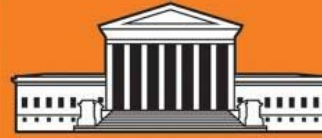
The U.S. Supreme Court