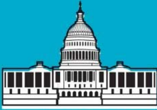
The U.S. Capitol