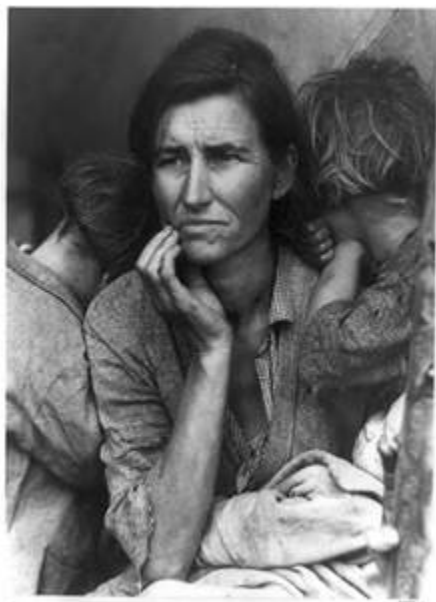
Unemployment Rates During The Great Depression